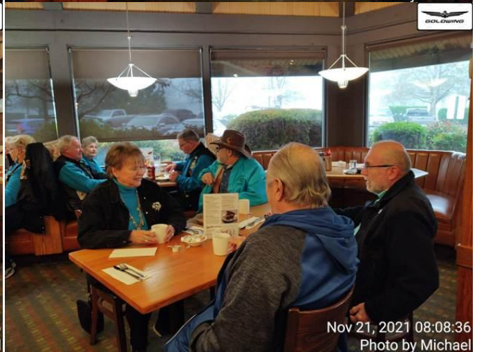
Nov 21, 2021 08:08:36