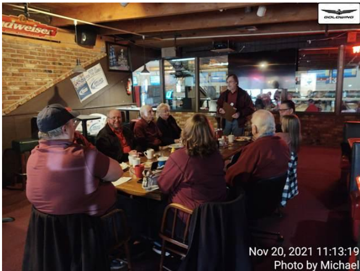
Nov 20, 2021 11:13:19