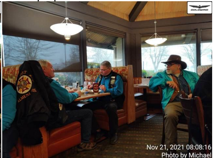
Nov 21, 2021 08:08:16