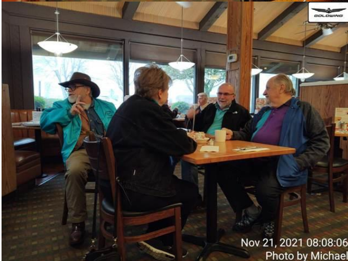
Nov 21, 2021 08:08:06