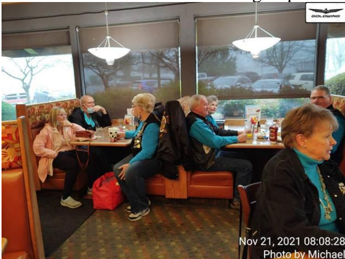
Nov 21, 2021 08:08:28

On Sunday, Pen and I visited with WA-I at the Shari's Restaurant in Olympia. It is so nice to have an excellent breakfast with such a group of wonderful people.